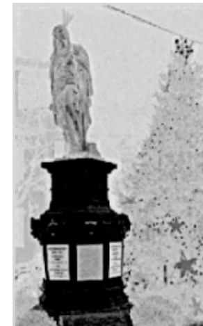
- Lawrence the Indian with the Stockade Christmas Tree -

... a holiday haiku stocking-stuffer from Schenectady