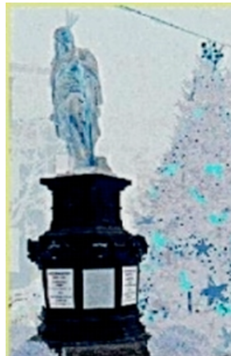
- Lawrence the Indian with the Stockade Christmas Tree -